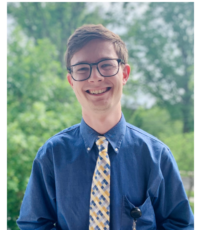
2021 Recipient of Earl Palmer Award