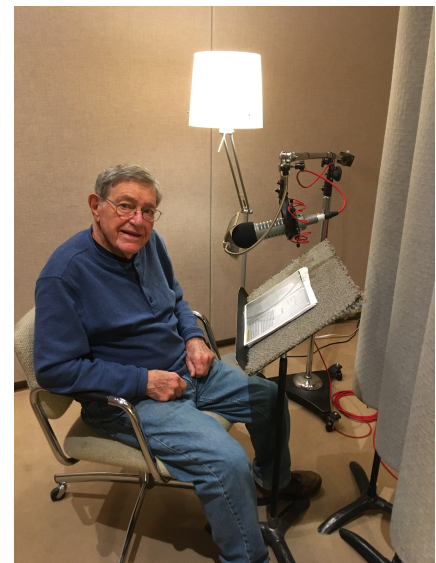
“All set to go” at recording studio