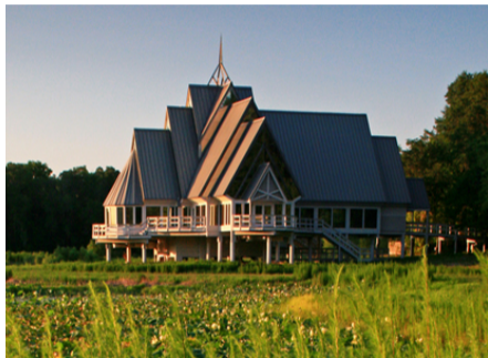
Mandi's Chapel at Camp Weed