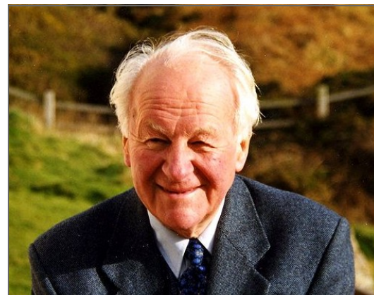
Rev. John R. W. Stott

Both had unshakeable integrity of character, both were missionary pastors at heart, both were alert to the needs of the world, and both loved people. As a pastor and as a person, my goal is to be faithful as they were. At the beginning of 2012 the mandate they modeled continues for us at EPM, whether it is a Kindlings Muse evening, or at the three Word and Worship times in February, March, and April, or while I am with the Annapolis Midshipmen for a weekend retreat this January. Best of all, it is in the most ordinary of places where we discover the trustworthiness and goodness of Christ.