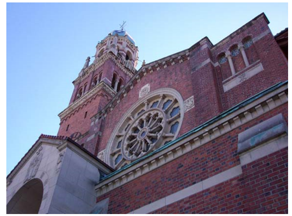
The Historic First Presbyterian Church, host for the teaching series on Romans is located at 20 Tacoma Ave South, Tacoma, Washington 98402.