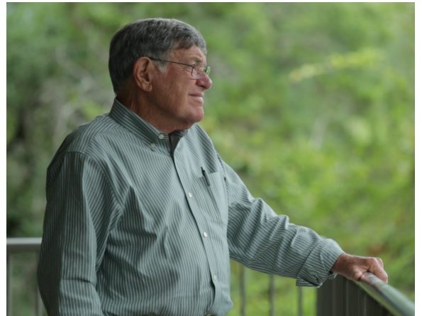
Time out at Laity Lodge, TX - Summer 2014

As we trust in this victory we are entrusted with the assurance of reconciliation. Jesus explains the power of this assurance in the Sermon on the Mount (Matthew 5, 6, 7). He tells his disciples to stand in place with cheek exposed to the angry face of hostility; to love those who are considered as enemies, to pray for God's forgiveness of one's trespasses, and then to ask for strength to forgive those who trespass against them. He gives a strategy: "If you are on your way to make an offering at the altar of God and you remember that your brother has something against you, stop what you are doing and first go and be reconciled to your brother..." (Matthew 5:24). Here, Jesus uses a combined Greek word, dialogos . Our word dialogue comes from this word. It means to talk through the issue that has put your relationship into jeopardy. While Jesus uses a word for reconciliation different from katalasso , the word in this passage depends upon the power of katalasso .