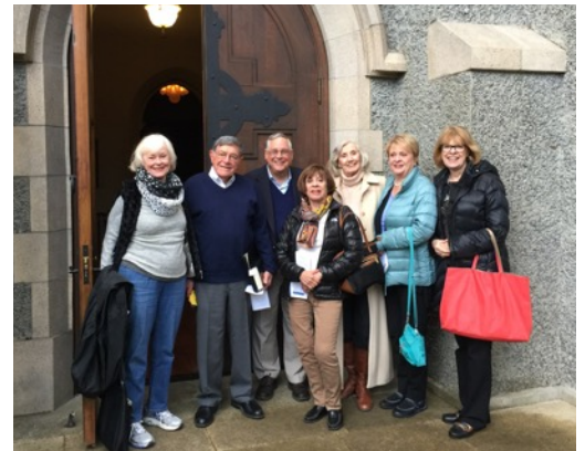
Friends from Berkeley show up at chapel for Word and Worship in Seattle

How does this gift of friendship happen? For Paul it was first the generous and faithful love that he experienced on the road to Damascus when Jesus met him at noontime (Acts 9). Then a day later he experienced assurance and healing from the band of Christians at Damascus (Acts 9). He is shaped by both of these events to become a man in Christ and a man of the church. C.S. Lewis helps us to understand: "Friendship...[is] about the truths held in common. In friendships like this, Lewis says there is the "what you too! I thought I was the only one" factor—the recognition of a shared vision ( The Four Loves , p. 96). Friends stand side by side and together look in the same direction toward a shared goal and discovery. In that side by side solidarity, a soul mate companionship happens and with it a love that each share from the One who found them – before they were looking. It still happens today.