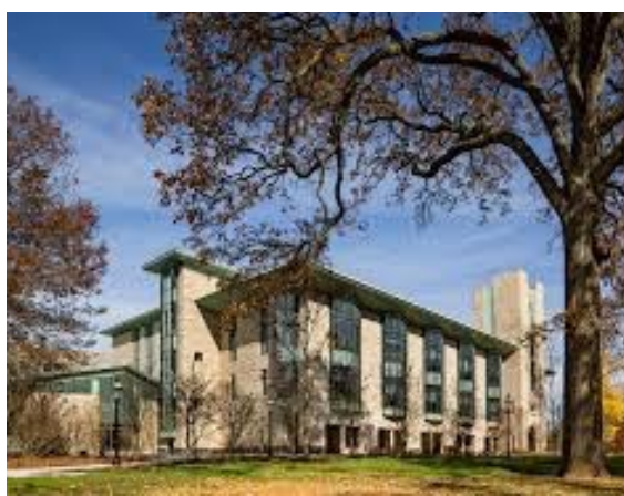
The library at Princeton Theological Seminary